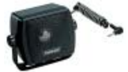
External Speaker SP-7