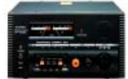
AC Power Supply(30A) FP-1030A