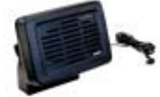
High-Power External Speaker MLS-100